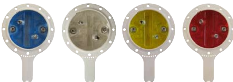
with 0 degree i-Disc