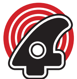
with 6 degree i-Disc