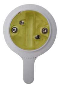
with 4 degree interdisc