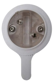
with 2 degree interdisc