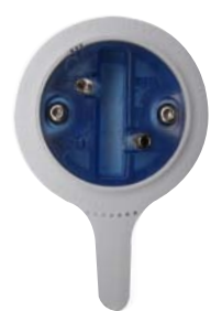
with 0 degree interdisc