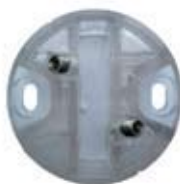
2 degree interdisc