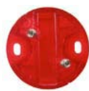
6 degree interdisc