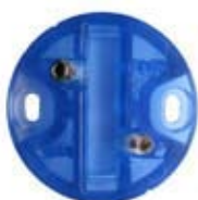
0 degree interdisc