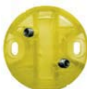
4 degree interdisc